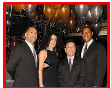
After Dinner Entertainment 4The Beat Band