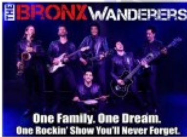
THE BRONX WANDERERS One Family. One Dream. One Rockin' Show You'll Never Forget.

Cocktails and Appetizer Buffet at 5:30 PM - Open Bar