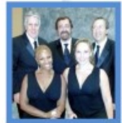
Dinner Entertainment Phase4