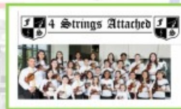
Cocktail Entertainment 4 Strings Attached