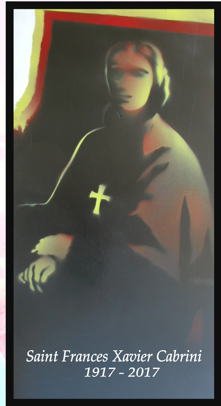
Saint Frances Xavier Cabrini 1917 - 2017

OPENING NIGHT November 14 5:30 -7pm. Exhibit runs through December 22. 2017